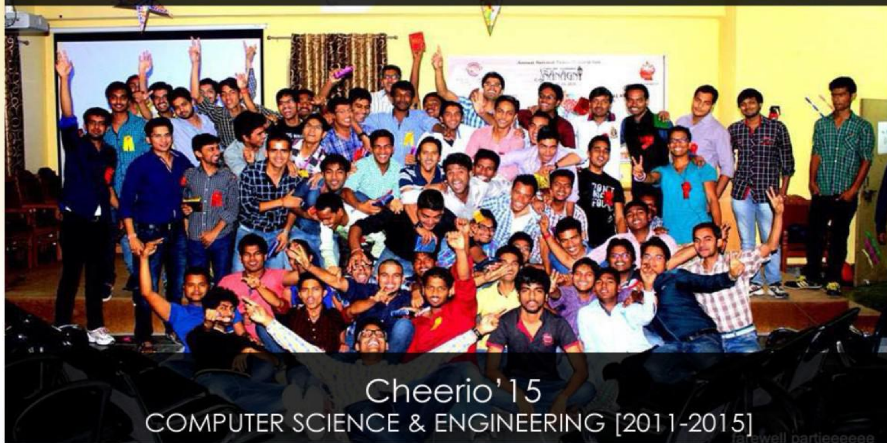
Cheerio '15 COMPUTER SCIENCE & ENGINEERING [2011-2015]

Faculty of Engineering & Technology, Gurukul Kangri University Haridwar, Uttarakhand